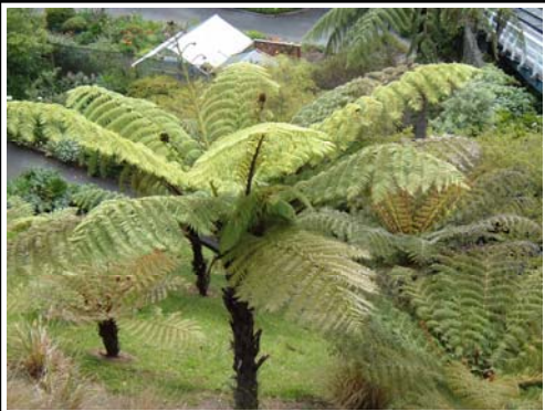
The Wellington Botanical Gardens

While in Wellington visit these attractions Use information in the Museum to help you fill in these boxes