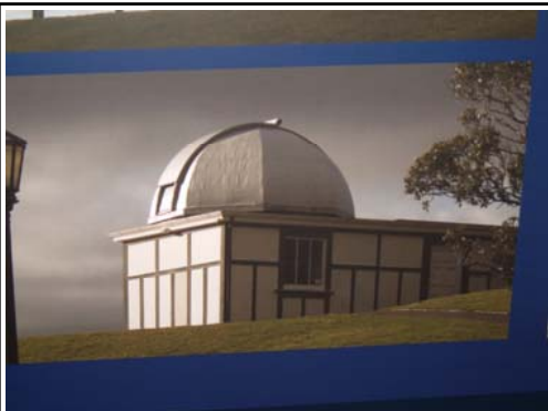
The Carter Observatory